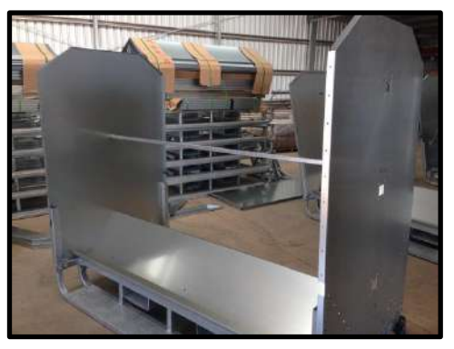
STEP 11 : The ends are now more secure.