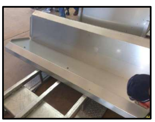
STEP 8: Place cage nuts into base.