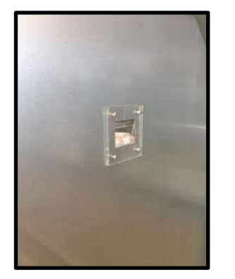
STEP 17: Inside of the end fit sight glasses.