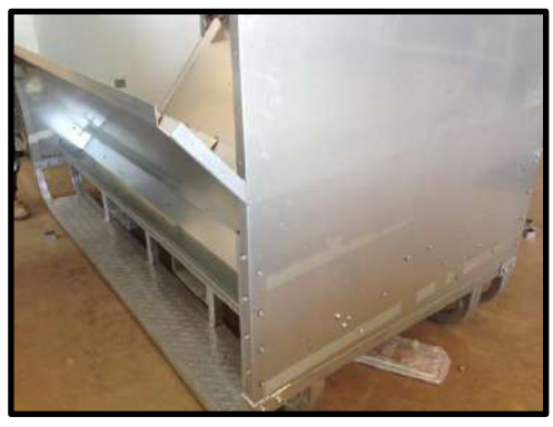
STEP 29: Divider in position.