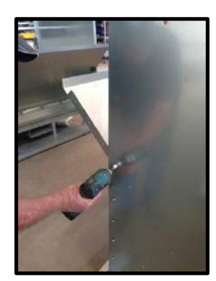
STEP 31: Attaching divider to end.