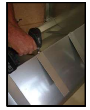
STEP 24: Fit the seven straps to base. Holes located at the top of the bend of the base.