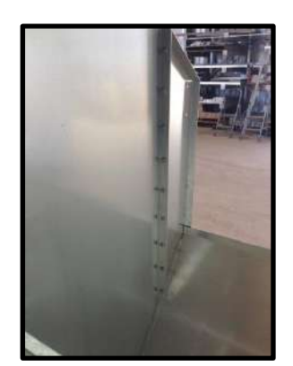
STEP 58: Inside view of finished product.