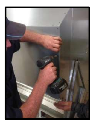
STEP 66: Tek screw the bottom bend then tek screw the side completely to feeder (Do not miss any holes).