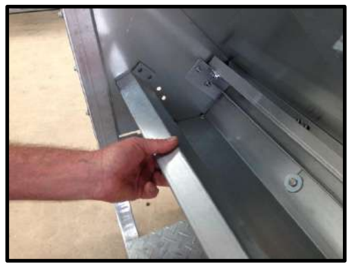
STEP 53: Attach bottom adjuster (Has 3 slots).