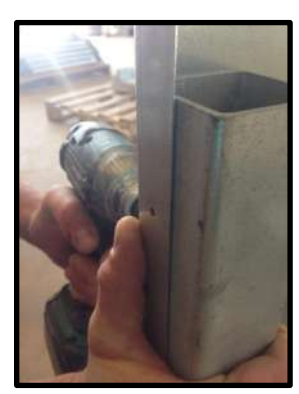
STEP 6: Ensure post and edge of end are fitted with no gap. Tek screw ends fully to posts.