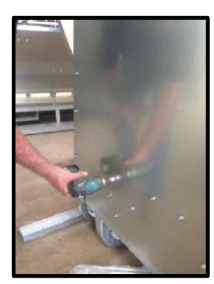
STEP 30: Tek screw to end.