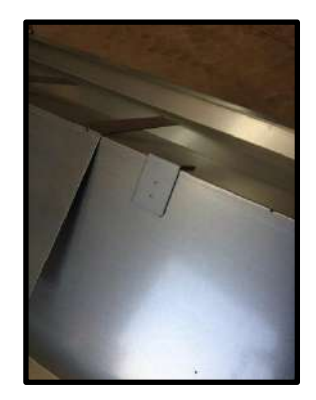
STEP 20: Secure angle pieces to base. The letter 'T' must be on top of the other angle.