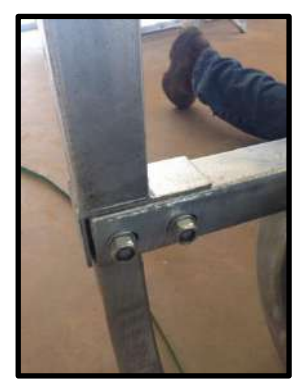
STEP 3: Loosely tighten nuts to allow some movement in post.