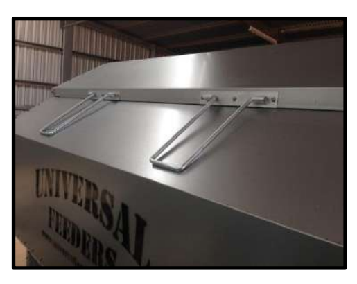
STEP 77: Attach the lid handles to the lid using holes provided in the lid.