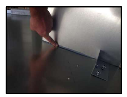
STEP 27: Selastic gap between the base and the end (Do not selastic below adjuster bracket). Tighten.