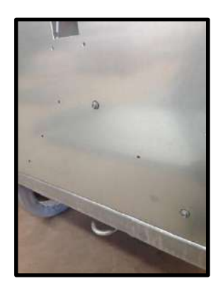
STEP 13: Tek screw to ends.