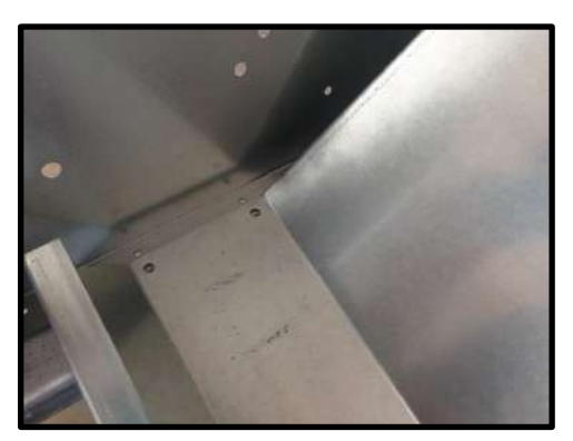
STEP 12: Fit base to ends. Line up holes.