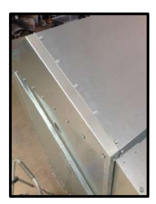
STEP 74: Ensure all screws are fitted to holes.