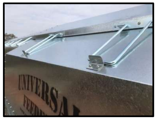
STEP 78: Tek screw angle into holes provided. This will form self-locking of lid.