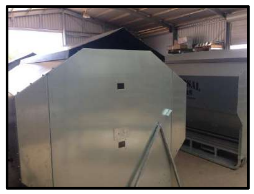
STEP 70: Place lid onto feeder.