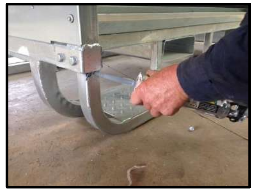
STEP 80: Fully tighten bolts and nuts connecting posts to base. Selastic the bottom of the posts to the frame so they are water proof.