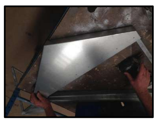
STEP 43: Pull down firmly and screw.