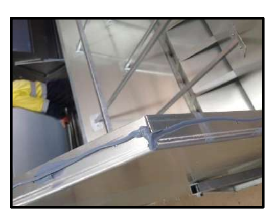
STEP 61 : Be sure to silicon all gaps.