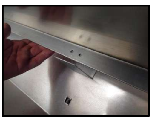
STEP 33: Attach straps that are screwed into base to divider. Holes are to be lined up.