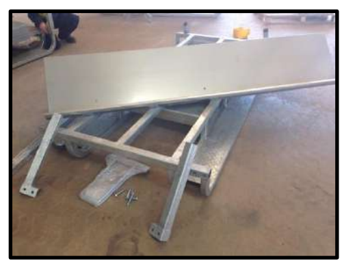
STEP 1: Lay posts out on each corner (Left and right) and base onto frame and lid hinges.

Building the feeders is quite simple as long as you follow the steps outlined below exactly. Any steps that are missed will reduce the strength and efficiency of the feeder and void warranty.