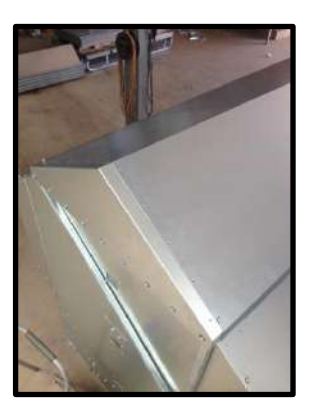
STEP 73: Top view of connection.