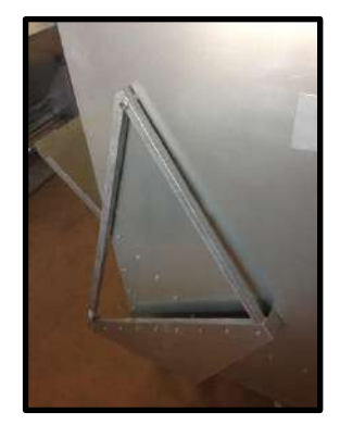
STEP 48: Tighten so lid hinge is firm but moves freely.