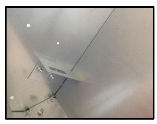
STEP 26: Adjuster fitted (3 holes in end). Use 8mm bolts and nuts.