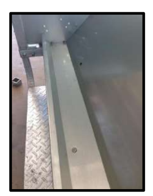
STEP 15 : Ensure all screws are fitted. (If there is a hole it needs screwing).