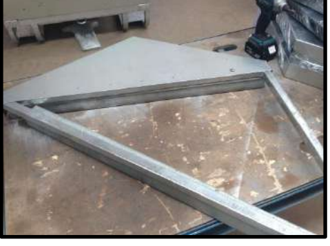
STEP 41: Attach lid end to lid RHS end.