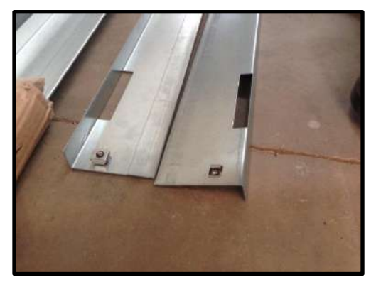
STEP 49: Attach cage nuts to upper adjusters. One each end (Note which way the cage nut is attached).