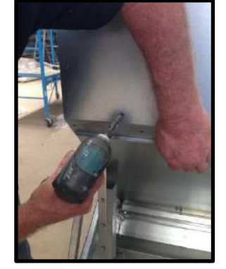
STEP 65: Second tek screw to be the second hole from the end (Do not do the hole at the end first).