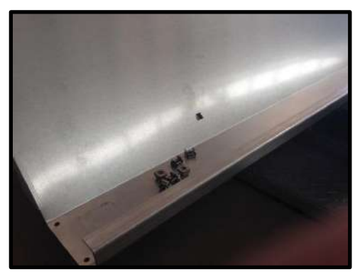
STEP 7: Diagram of cage nuts.