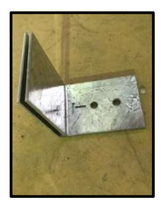
STEP 19: Place angle with 'T' on top of the other angle. This will form a gap which the upper adjuster will go between.