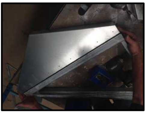
STEP 42: Another view.