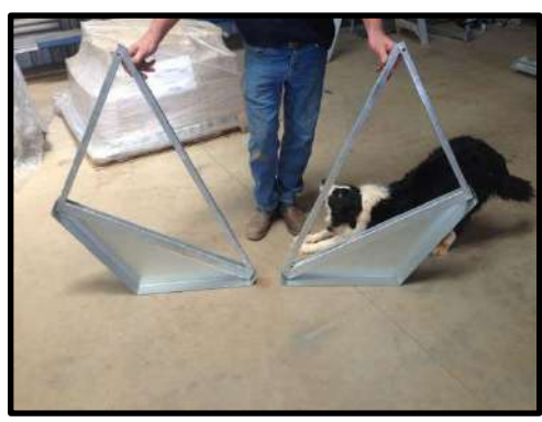
STEP 45: Always remember there is a left and a right side, so fit lid ends alternatively to lid RHS hinge.