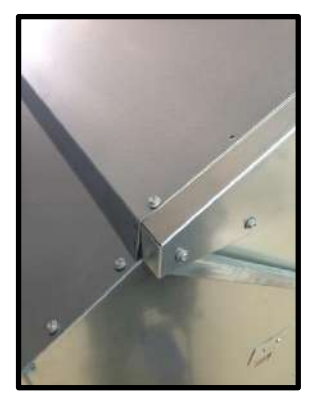
STEP 72: Connect lid hinge to feeder.