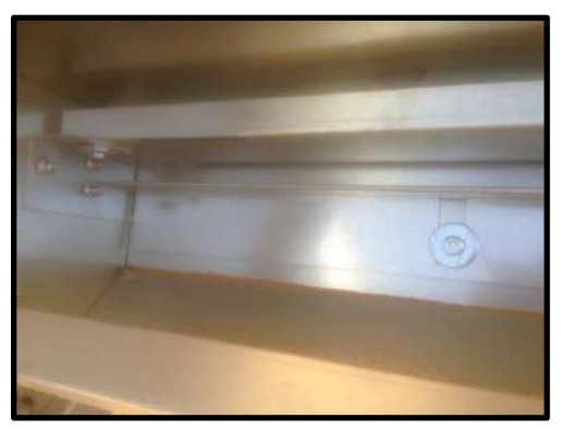
STEP 51: Attach bottom adjuster (3 slots in adjuster to the base). Bolt then large washer.