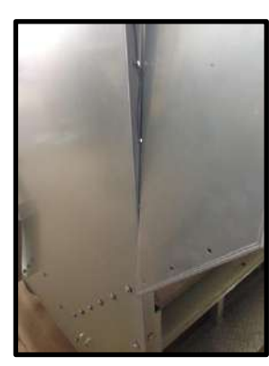
STEP 56: Attach the end extension.