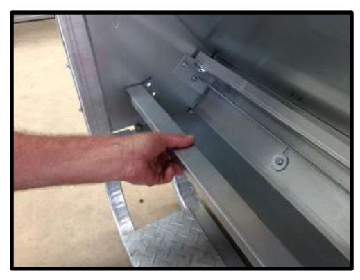
STEP 54: If attaching ad-lib pieces line up with the two holes on the ends.