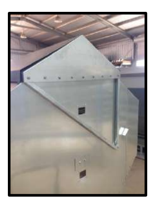
STEP 71: Connect lid hinge to feeder.