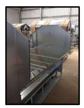
STEP 63: Feeder is now ready for sides.