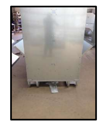
STEP 32: Both dividers in place. Ensure all holes fitted with tek screws.