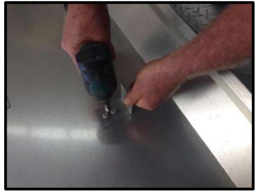
STEP 22: Fit angle pieces ('T' on top).