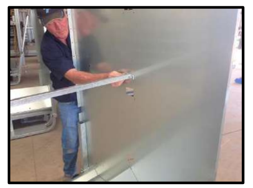
STEP 10: Connecting main support.