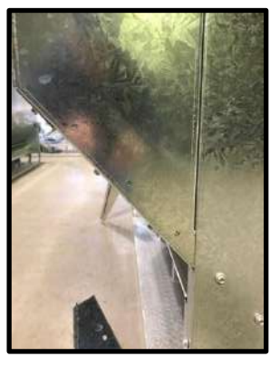
NOTE: Do not tek screw these 3 holes. These will be done when rain guards are fitted.