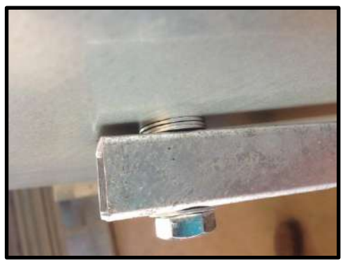
STEP 46: Attach lid hinge to end, one washer between bolt and RHS, three washers between RHS and end.