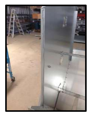
STEP 55: Silicon the end.