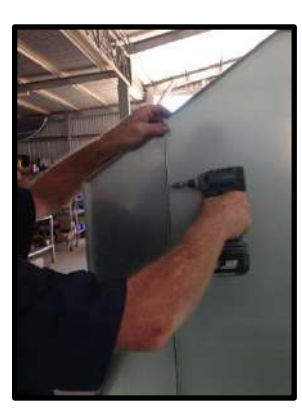
STEP 57: Screw inside out.