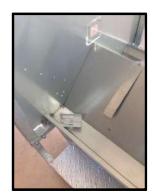
STEP 25: Adjuster bracket (Left and right).