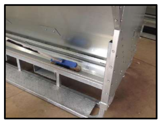
STEP 79: Ensure completely clean as any filings left will rust.