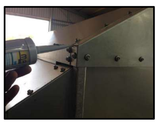
STEP 81: Selastic all areas that are exposed to water.