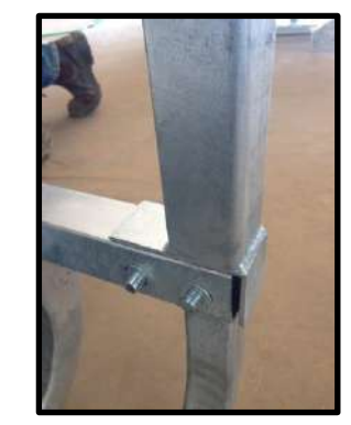
STEP 2: Connect post to frame. Ensure flat washer is put in front of nut.