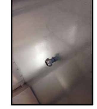
STEP 47: Put nut on inside of the feeder.