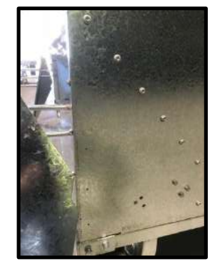
STEP 5: Don't tek screw this side of ends. This will be done when rain guards are fitted later.