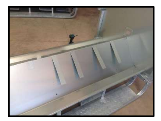
STEP 23: Lay out straps on top of base.