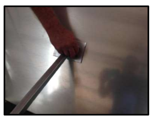
STEP 39: Attach nuts on the inside of the feeder.