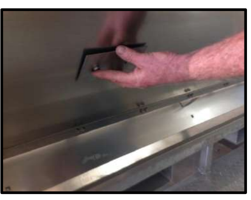
STEP 38: Attach supports to divider. Plate is to go onto the outside.