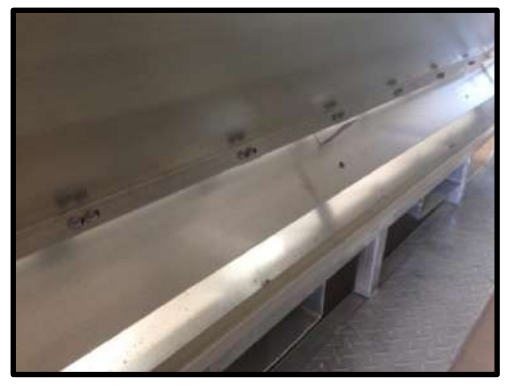
STEP 36: End result (Be sure not to miss any holes).