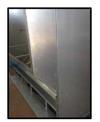
STEP 59: Outside view of finished product.