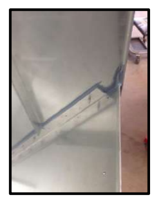
STEP 60: Silicon the divider to the end.