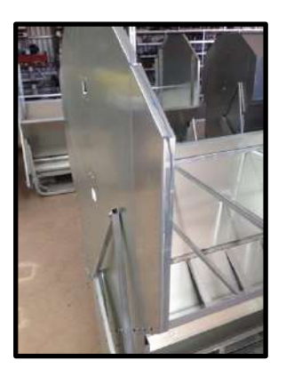
STEP 61: Silicon the end extension ready for sides.