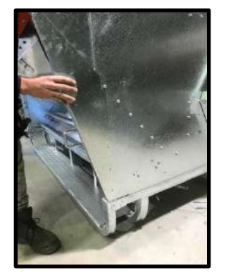
STEP 76: Tek screw rain guards to feeder.