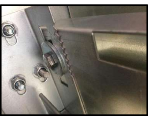
STEP 50: Attach upper adjuster to adjuster bracket using 8mm bolt and large washer.