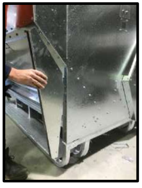
STEP 75: Place rain guards on all 4 corners of feeder (There is left and right).