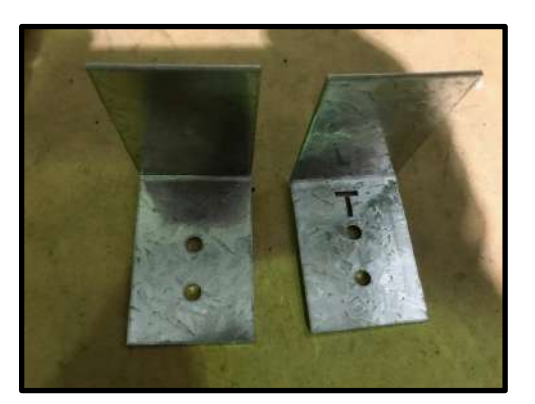
STEP 18: Identify 2 pieces of angle and one with 'T'.