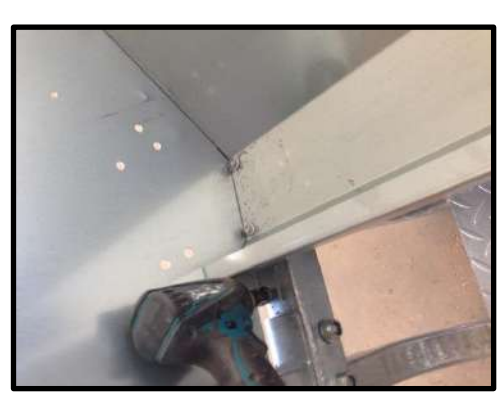
STEP 14: Secure base to frame and ends.