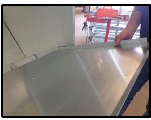
STEP 28: Slide dividers through slot in end.