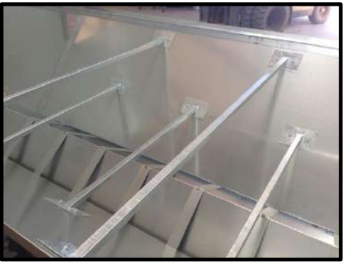
STEP 40: Finished look of Large and Extra-large feeders (Medium has only one top support).