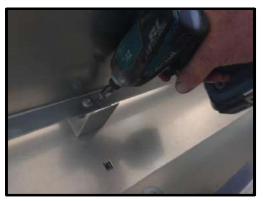
STEP 35 : Two screws per strap.