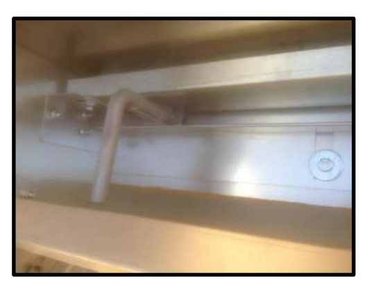
STEP 52: Set adjusters so upper adjuster 15mm from bottom to base, 20mm from lower adjuster to upper. This will give approx.. 300gm/day.