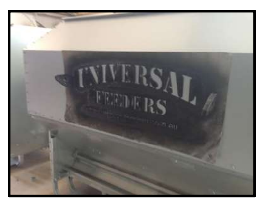
STEP 69: Tek screw all remaining holes ensuring none are missed.